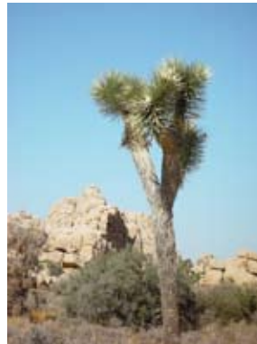
standing tall [DP003] Joshua Tree - Palm Desert, CA