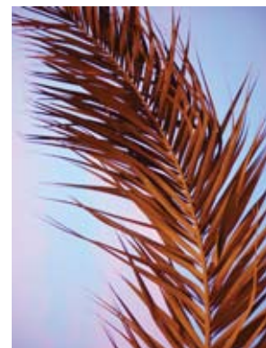
palm fan [DP008]* Joshua Tree - Las Vegas, NV