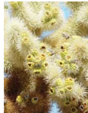
sticky situation [DP004]* Joshua Tree - Palm Desert, CA