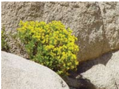
wildflowers rock [DP001] Joshua Tree - Palm Desert, CA

These are prints from my travels and personal photography, offered to you at affordable prices and available in a variety of sizes or custom formats. Let us know if you need them in other sizes or custom frames and mats.