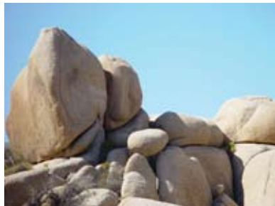
rock foundation [DP002] Joshua Tree - Palm Desert, CA