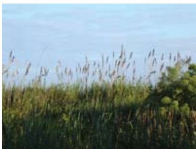
grass splendor [DP005] Myrtle Beach, SC