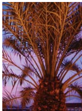
sunset palm [DP007] Joshua Tree - Las Vegas, NV